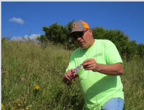
Photo caption: Native flowers like this rough blazing star can be found scattered throughout this prairie wetland complex. Nicholson Wetland Protection Area near Fergus Fall, MN

Our prairie and savanna restoration projects remove invasive trees and brush from public land. This fall, chainsaws and heavy equipment were deployed on this 160-acre site to remove trees invading historic remnant prairie. Did you know, only 1% of our Native Prairie remains?