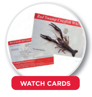
WATCH CARDS Small fold out species-specific informational card. Available for over 10 species.

2.5" x 11" decal using the principles of Community-Based Social Marketing. Bumper sticker quality material perfect for vehicles, boats and trailers.