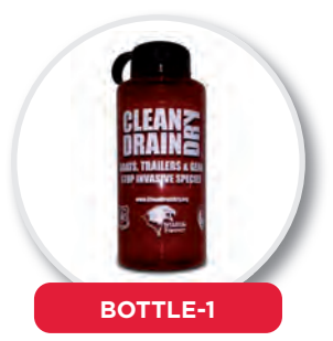
WATER BOTTLE 32 oz water bottle. Durable, dishwasher safe and BPA free.