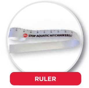
FISH RULER DECAL 36" x 1" ruler decal. Made with weather resistant materials and space for your logo.

8" x 8" window cling with UVresistant ink. Suitable for all seasons. Choose between three designs.