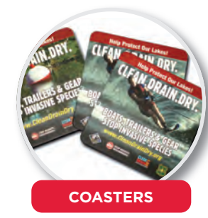
BAR COASTERS Two-sided, full color, 3.5" x 3.5" bar coasters. Many designs available.