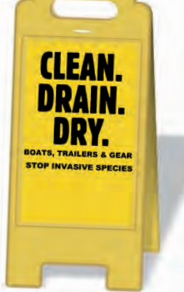
SAFETY SIGNS 25" x 12" folding signs made of durable plastic.