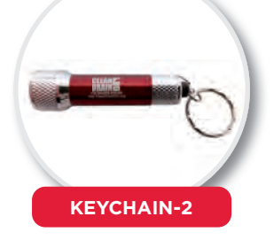
FLASHLIGHT KEYCHAIN Convenient flashlight allows for inspection in hard to see places.

2.5" button attaches to most clothing fabrics with safety pin clasp on the back.