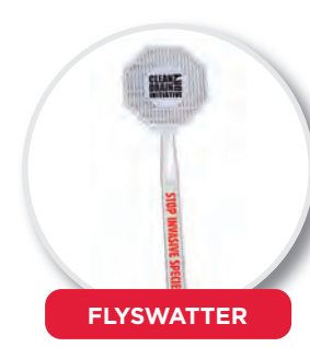
FLYSWATTER 16" Flyswatter with 4"x5" mesh head.