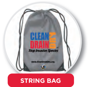
STRING BAG Perfect for carrying items to and from the water.