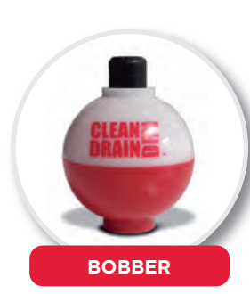
CLEAN DRAIN DRY BOBBER 1.25" plastic fishing bobber.