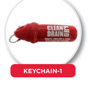
KEY FLOAT Water-resistant, floating keychain with removable top.

Click action ball point pen with stylus tip writes with smooth, medium-point black ink.