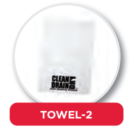
SHAMMY TOWEL Super absorbant 16"x10.5" felt shammy towel.

Heavy duty scrub brush with 20" handle for hard to reach places.